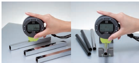
Measurement example of the square pipe and the pipe