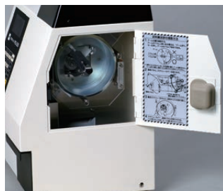
Side Door for Cleaning