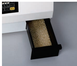
Large Sample Case

Since a large-volume sample case is used for disposal after measurement, there is no need for sample disposal after each test. When the sample feed unit becomes clogged, the side door may be opened for easy cleaning.