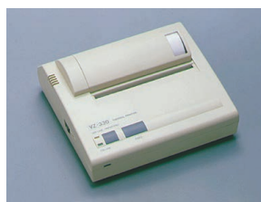
VZ-330 Printer (Optional)

KETT ELECTRIC LABORATORY 1-8-1 Minami-Magome Ota-Ku, Tokyo 143-8507 Japan Tel. +81-3-3776-1121 Fax. +81-3-3772-3001 URL http://www.kett.co.jp/ E-mail overseas@kett.co.jp